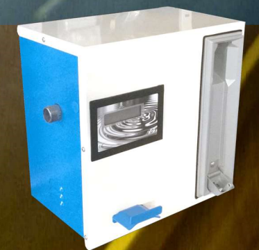
Distribox ELEC with CA701 calculator