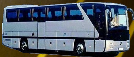
Vehicle equipped with TX008

date / agent / vehicle / mileage / volume / product.